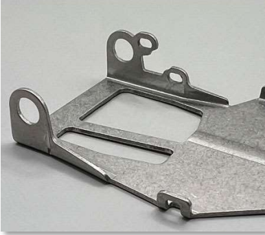
C95 Original Mount

The photo on the left shows the chassis motor mount as originally manufactured.